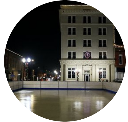
Ice Skating at Marion's Tower Square