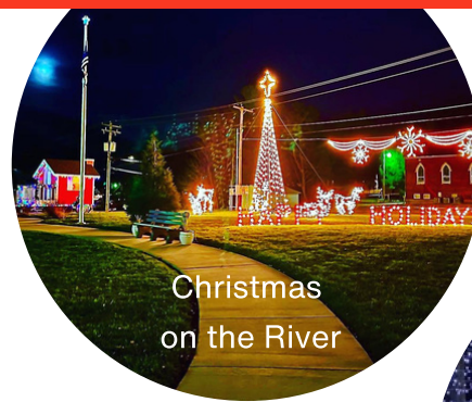
Christmas on the River