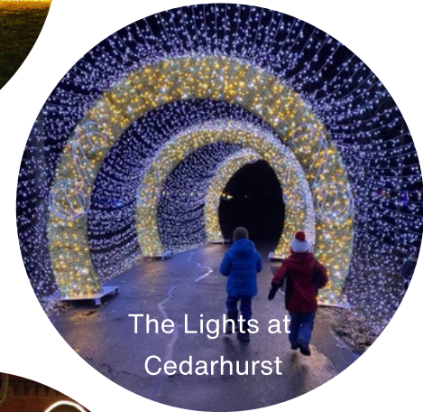
The Lights at Cedarhurst