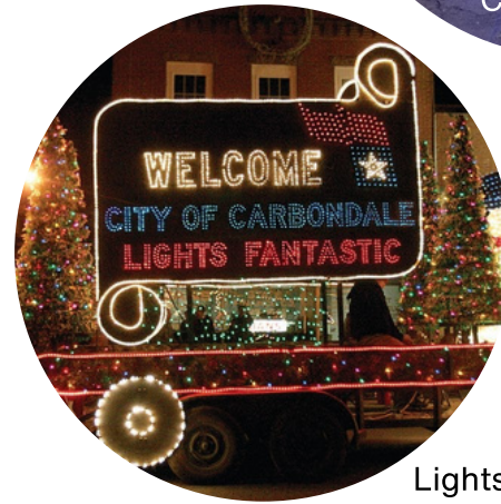
Lights Fantastic Parade