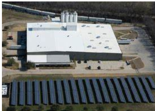
Manner Polymers' new PVC compounding plant in Mt. Vernon will have a 15-acre solar farm.

With two major announcements in our region, it is clear that the Reimagining Energy and Vehicles (REV) Act is already paying dividends in Southern Illinois. Administered by the Illinois Department of Commerce and Economic Opportunity (DCEO), REV offers competitive incentives for companies that manufacture parts to be used in electric vehicles (EV) or renewable energy such as wind and solar. With support from the REV Illinois incentive package, Texas-based Manner Polymers recently chose Mt. Vernon for its new state-of-the-art facility to manufacture PVC compounds for EVs and components for solar panels. Similarly in Perry County, Du Quoin's Prysmian Group announced a $63.8 million dollar expansion with help from the REV program. This long-standing Southern Illinois cable manufacturer is expected to add 80 new jobs to increase its manufacturing capacity for the energy and telecom cable industries.