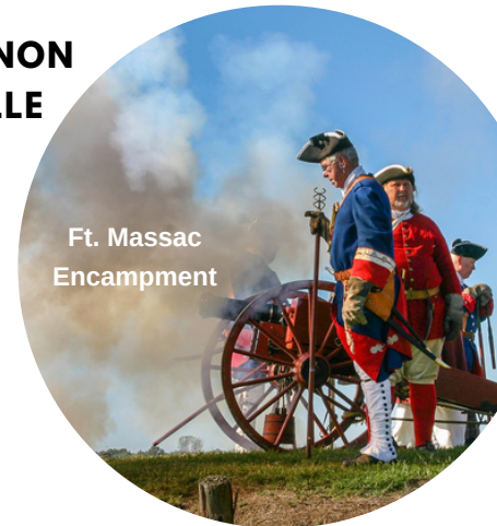
Ft. Massac Encampment