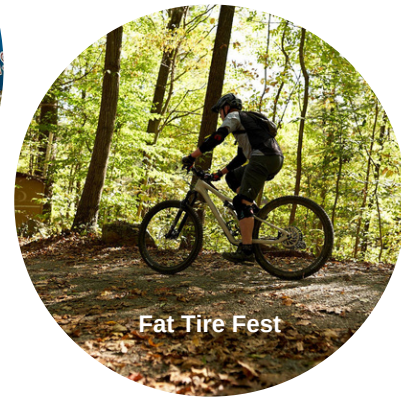
Fat Tire Fest